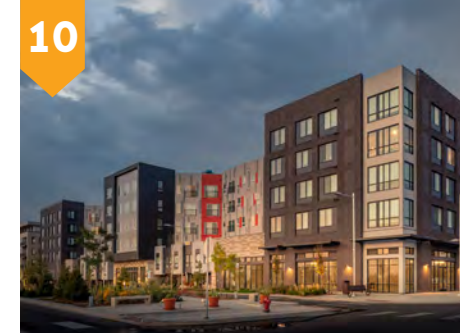
OPEN 8877 Eaton 118 units/27k s.f. retail

OPEN Ascent Westminster 255 units/22k s.f. retail