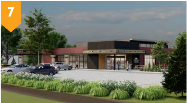
OPENING Q2 2023 Marczyk Fine Foods 8k s.f. retaill